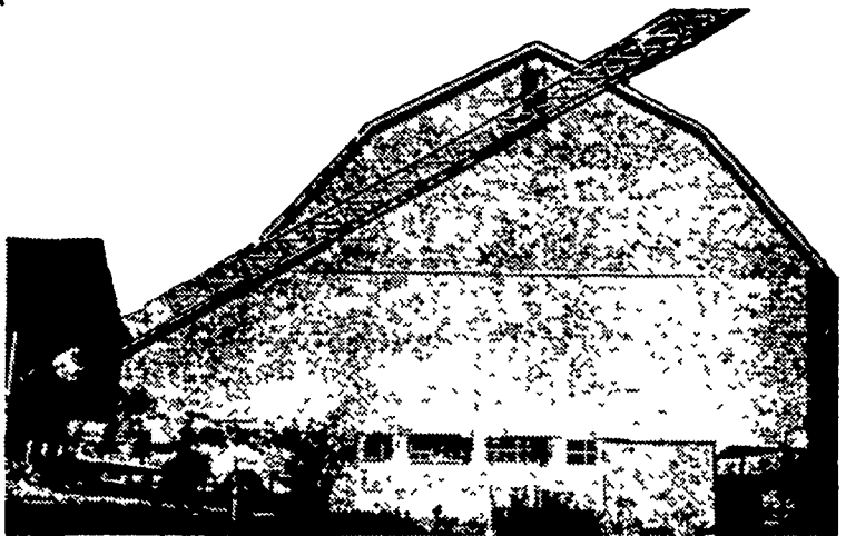
Aerial Ladder Equipment Used To Paint Your Farm Buildings

For Complete Information and Prices Contact