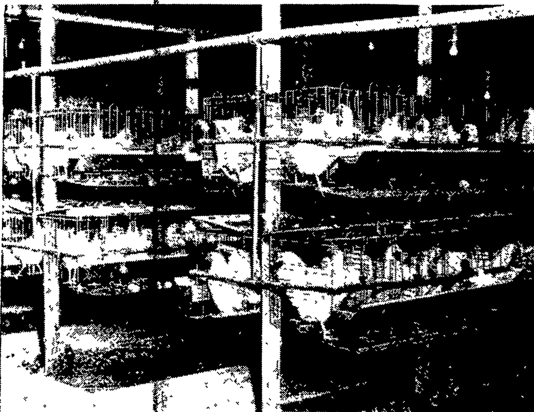
A practical way to convert an old building to cages.

Poultry Equipment is our Business — Cages is our Specialty. Also, we sell, install and service — Hart Cup Watering Systems, Brock Feed Bins, Complete Bramco-Oakes Poultry and Hog Equipment and all types of ventilation.