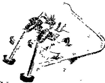
SURCINGLE for stanchion barn use