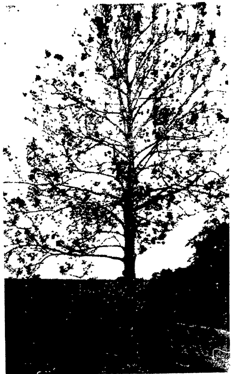
TYPICAL of the appearance of the sycamore trees in the area is this tree growing at the Penn State University Research Farm near Landisville. While some of county sycamores show fewer leaves than this one, some others look in a little better shape. New leaves have been observed on several area trees, and the trees are expected to recover from the fungus that has hit them.

The USDA noted in the yearbook that the London planetree, which is considered a hybrid between the American sycamore and the Oriental planetree, is more resistant to anthracnose than the native variety, and is recommended for street and home plantings.