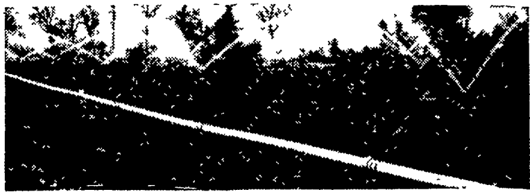
AGWAY IRRIGATION SYSTEM EQUIPPED WITH MARLOW PUMPS

WHICH TAKES ONE BIG GAMBLE OUT OF FARMING