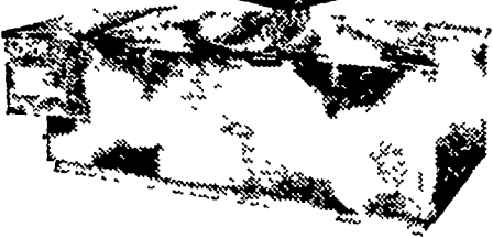
Model illustrated is island mounted—an ESCO exclusive feature. Gives lowest pouring height, easiest cleaning and neat appearance.

ESCO NOW! NEW LOW PRICES ON 'ICY WALL' ESCO BULK MILK COOLERS!