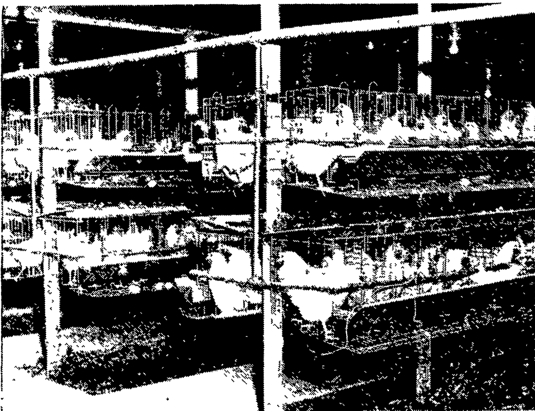
A practical way to convert an old building to cages.

Poultry Equipment is our Business — Cages is our Specialty. Also, we sell, install and service — Hart Cup Watering Systems, Brock Feed Bins, Complete Bramco-Oakes Poultry and Hog Equipment and all types of ventilation.