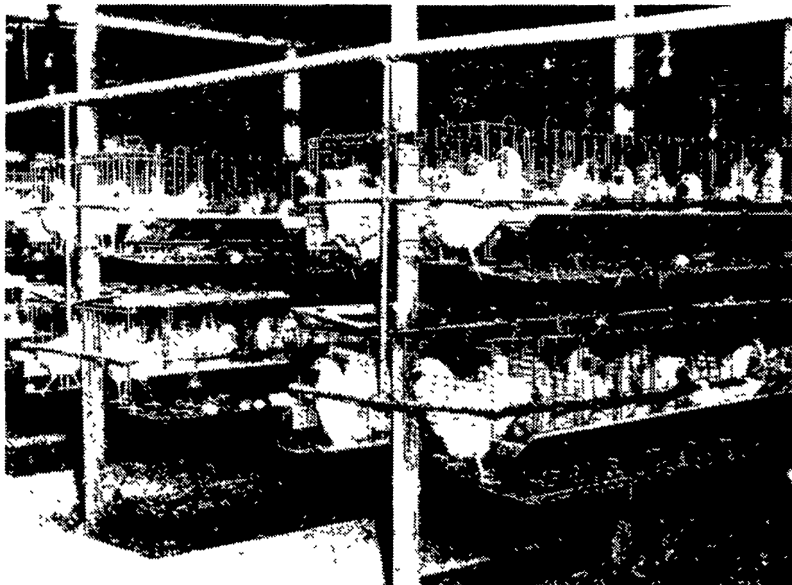
A practical way to convert an old building to cages.

Poultry Equipment is our Business — Cages is our Specialty. Also, we sell, install and service — Hart Cup Watering Systems, Brock Feed Bins, Complete Bramco-Oakes Poultry and Hog Equipment and all types of ventilation.