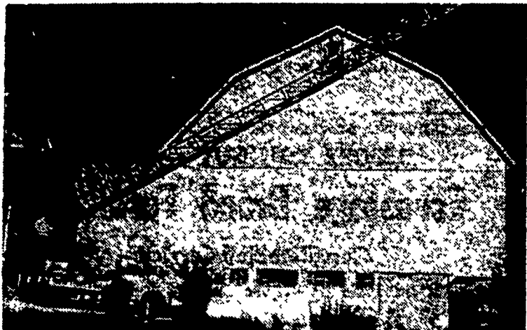
Aerial Ladder Equipment Used To Paint Your Farm Buildings