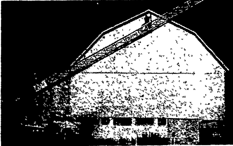
Aerial Ladder Equipment Used To Paint Your Farm Buildings

WE USE QUALITY PAINT AND IT DOES STAY ON!!!