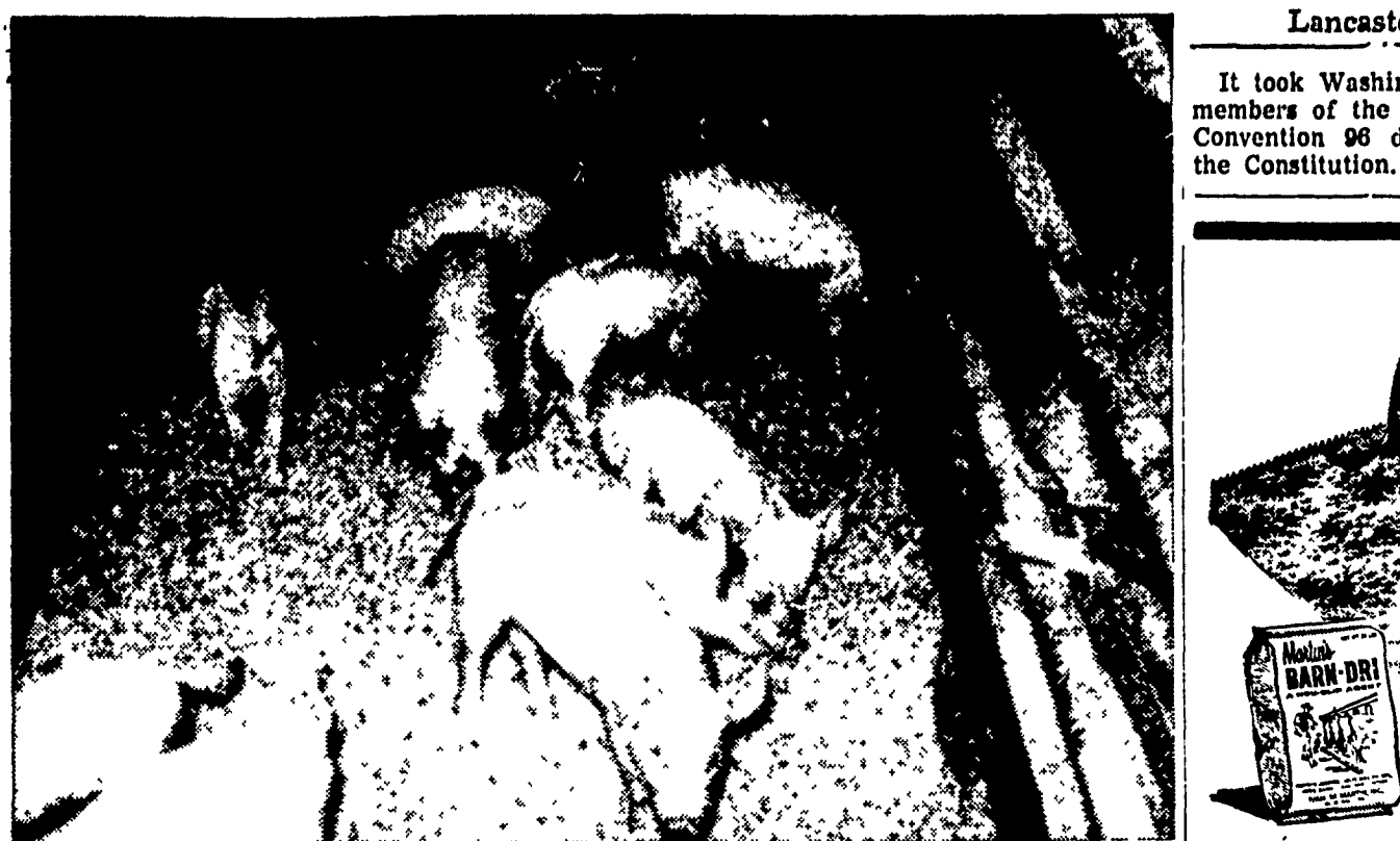
PIGS FROM ADJOINING LITTERS PLAY TOGETHER while their respective Mamas catch up on a little sleep in their farrowing crates. These two litters are nearly ready for weaning. When they reach 50 pounds they will be sold to customers who will fatten them for market.

members of the Constitutional to have you mention Lancaster Convention 96 days to frame Farming when answering their