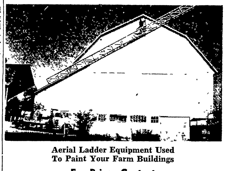
WE USE QUALITY PAINT AND IT DOES STAY ON !!!

It was announced that a The business meeting was countywide 4-H club meeting Countywide 4-H Field Day was ter; the exact date has not been set.