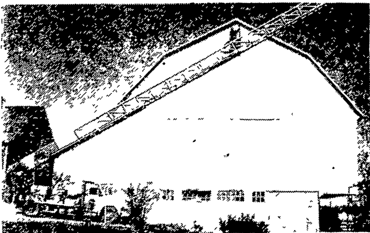
Aerial Ladder Equipment Used To Paint Your Farm Buildings

WE USE QUALITY PAINT AND IT DOES STAY ON!!!