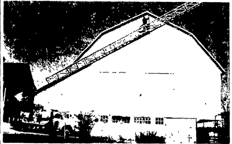
Aerial Ladder Equipment Used To Paint Your Farm Buildings