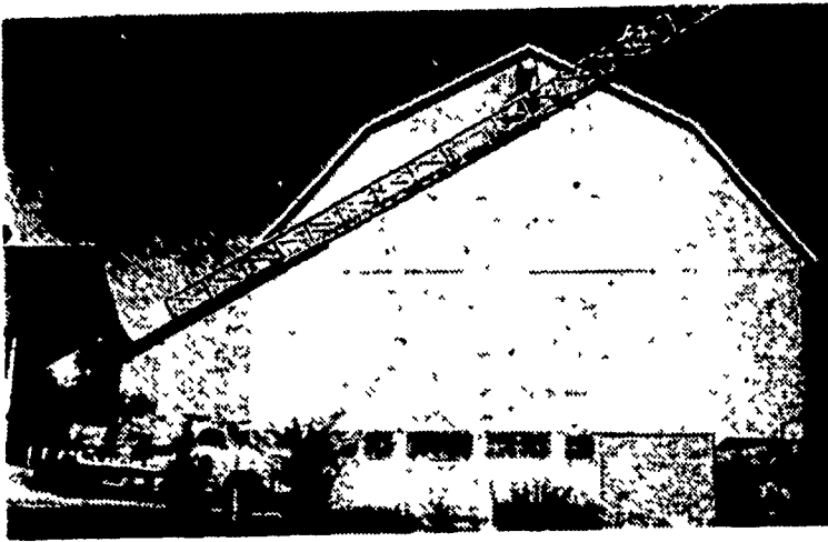
Aerial Ladder Equipment Used To Paint Your Farm Buildings