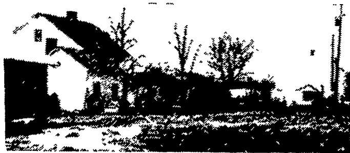
Photo Etchberger Farm

In Berks County, 7 Miles North of Myers-town, 1/2 mile Northeast of Rehersburg.