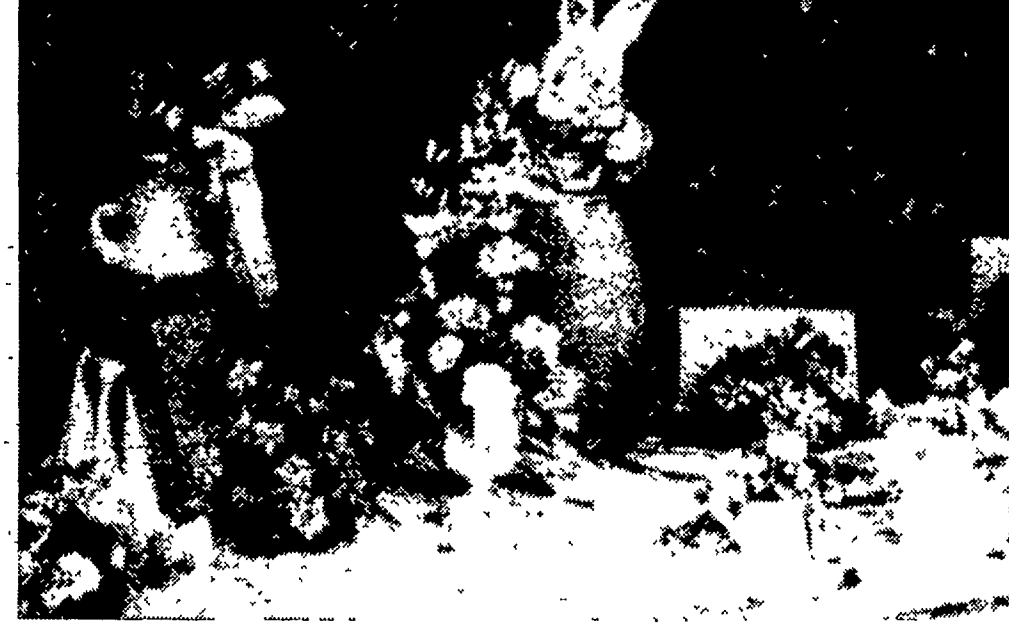
A CAMERA SHY "EASTER BUNNY" tops off this seasonal, floral window display at the retail shop of Girvin's Flowers, Leola Motorists passing by on the busy New Holland Pike see him at his tireless vigil, always on hand to welcome lected speakers, engaging in the many customers who visit Girvin's this time of the year.

Delegates will accomplish educational purposes of the conference through hearing se-(Continued on Page 7)