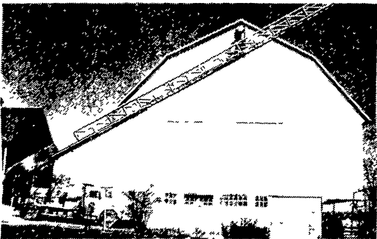
Aerial Ladder Equipment Used To Paint Your Farm Buildings

WE USE QUALITY PAINT AND IT DOES STAY ON!!!