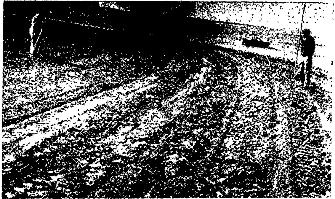
CHECKING CROPLAND TERRACE LEVEL at this Strasburg area site are county conservationist Wayne Maresch, left, and Ruben Keesee, conservationist, USDA Soil Conservation Service. The ridge where Keesee is standing was later planted to corn.