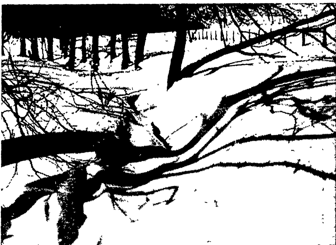
THE LITTLE BROOK SLEEPS beneath its snow blanket while the trees and their shadowy sentinels stand guard till Spring.