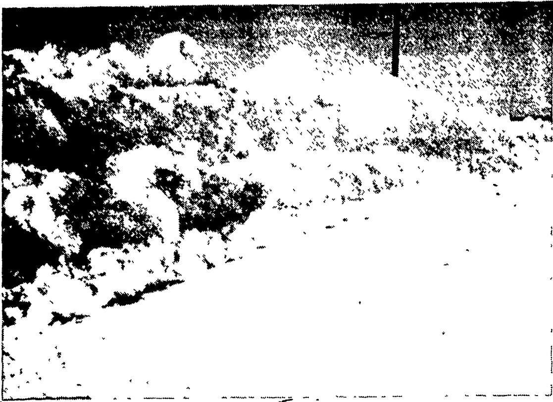
PLOW-MADE SNOWBANKS billow against a cloudless sky, no more to block man's passage on this country road.