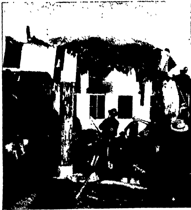
FIREMEN AND FARMERS WORK FEVERISHLY to remove a tin roof and tons of straw to prevent a cave-in on the cow stalls at the barn fire this week on Mrs. Sadie Esh's farm at Ronks R1. Estimated damage to building and contents was $35,000.