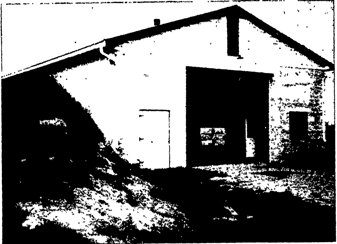
THIS IS A POTATO STORAGE BUILDING on the Reid Wissler farm. The 36 by 116-ft. structure was erected in 1962. It is large enough to store the entire 46-acre potato crop in 10-11 foot piles on the dirt floor, to house the entire grading operation, and will handle a large tractor-trailer truck at loading time. In the off-season it makes a convenient machinery storage shed. The block walls are steel reinforced, have concrete poured into the blocks, and are supported from the outside with block pilasters every 20 feet.