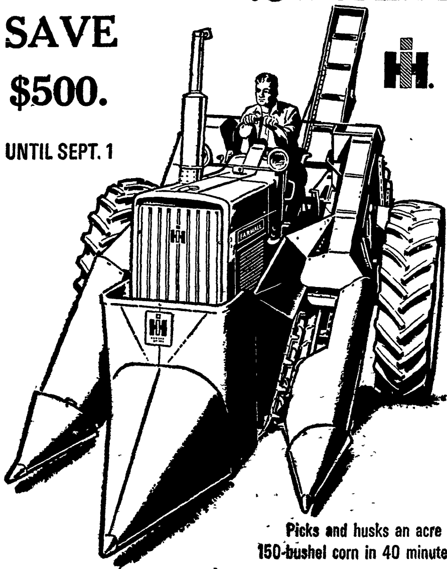
Picks and husks an acre of 150-bushel corn in 40 minutes!