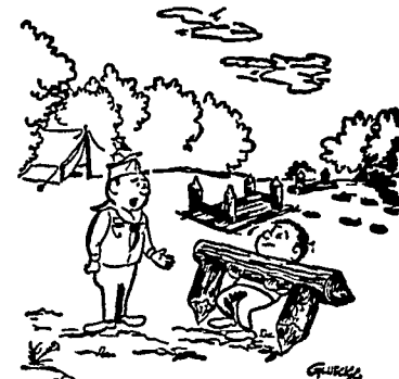
"How come you're always re-arranging the furniture?"