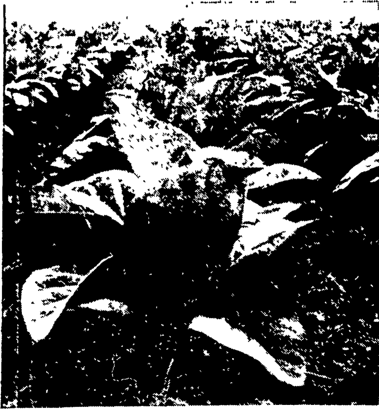
GOOD GROWTH is shown on these Penn Bel 69 tobacco plants on the Lester Weaver farm, north of New Holland. Weaver transplanted these on June 4, and they have grown remarkably in the six weeks since. The leaves are not as light-colored as this picture suggests; the sun was shining through them from behind, permitting the ribs to be plainly seen through the fine leaves. These are some of the best plants we've seen in the county yet this year.