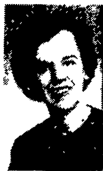
THOMAS Before You Call The Serviceman

Places that get extra strain, such as knees and elbows, will be reinforced with extra fabric or stitching.