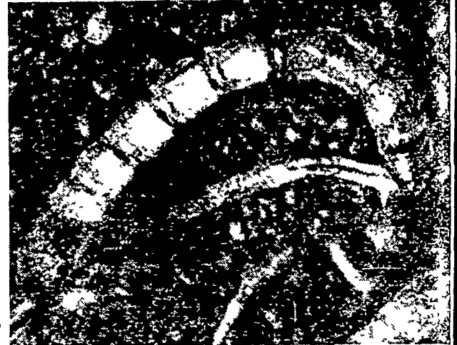
WIREWORM —Burrows into stem of tobacco plants.