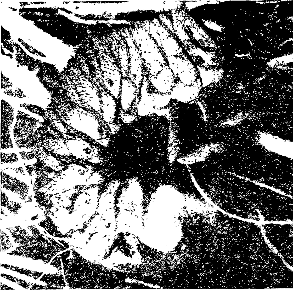
WHITE GRUB —This insect chews up tender roots as fast as they develop.