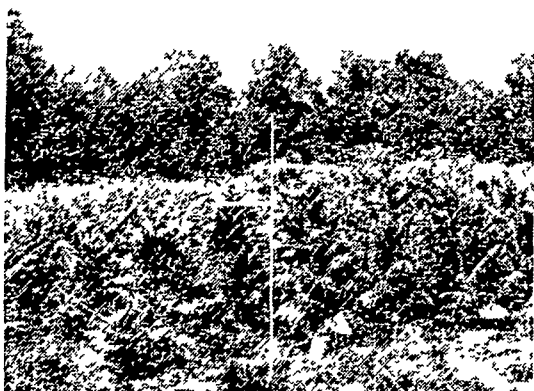
Aldrin-treated tobacco (right) is about 8 feet tall. Untreated tobacco (left) is about 5 feet tall.

Shell Chemical Company, Agricultural Chemicals Division, 2299 Vauxhall Road, Union, New Jersey.