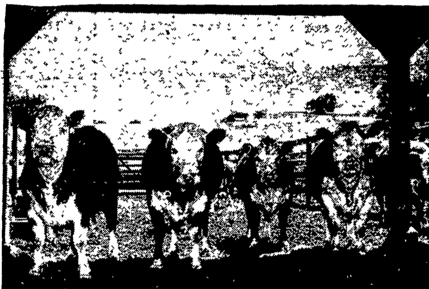
Here is just one of nearly 300 test pens of cattle used to develop the new Special Steer Fatenas at Purina's Research Farm. Four years of testing involved more than 2500 test cattle.