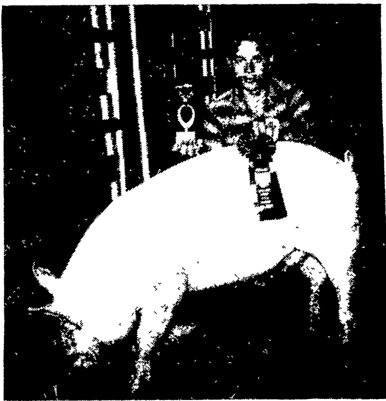
Randall Stoltzfus and his Grand Champion Yorkshire. This barrow was selected as the best of the 141 hogs in the FFA Hog Show and Sale held at the Green Dragon Market and Auction this week.

Temperatures during the next five days are expected to average 2 to 6 degrees below the normal range of 85 in the afternoon and 65 at night. Cooler over the weekend with moderate temperatures Monday and Tuesday. Cooler again about Wednesday. Precipitation may total 1/2 inch or more as showers early Saturday morning and again late Tuesday.