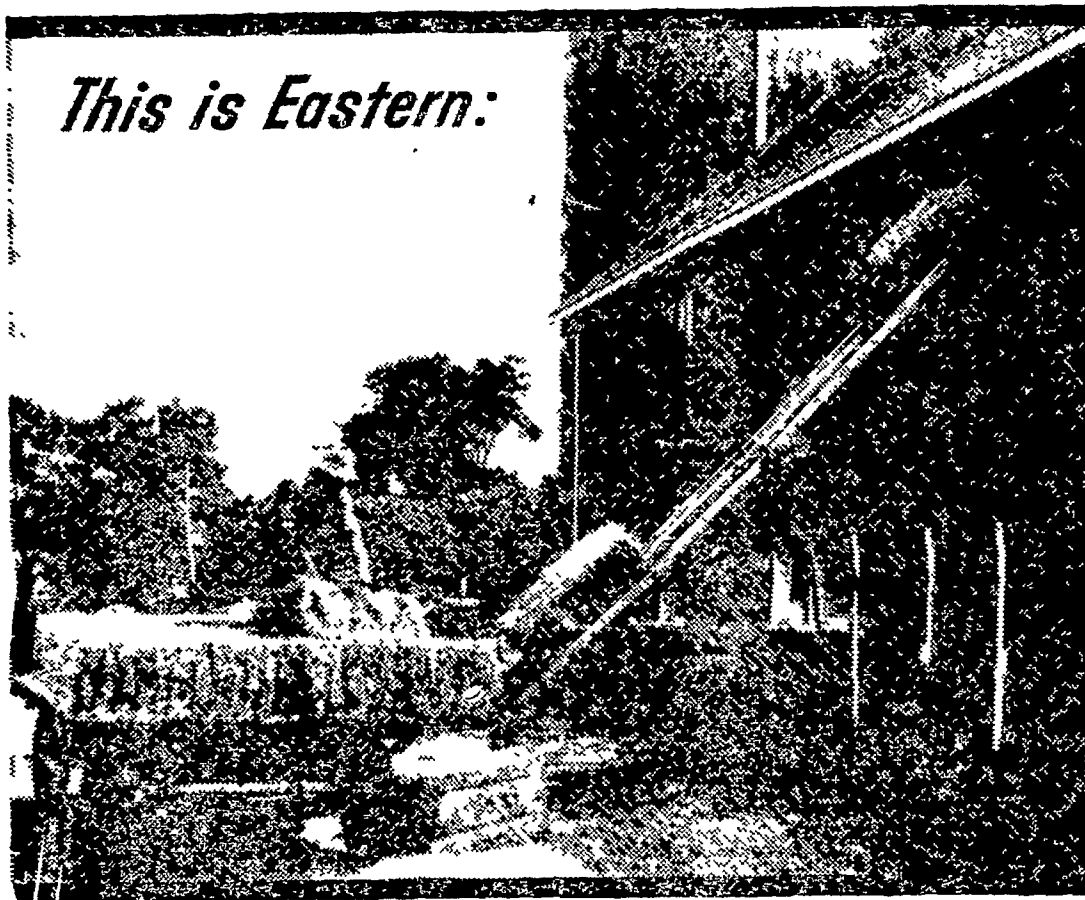
Farmers load barn with next winter's feed.