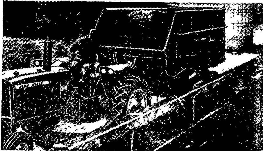
TWO CHUCK WAGONS No. 112 and 115