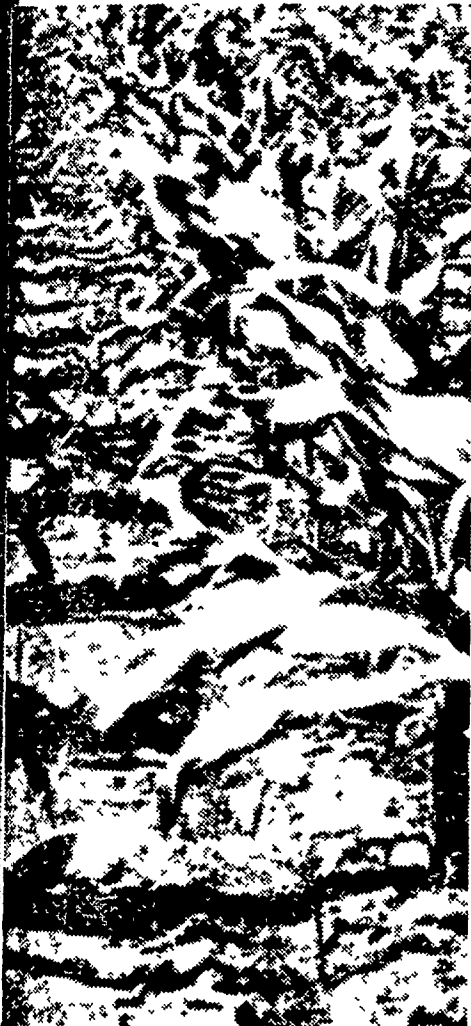
Applied pre-emergence in corn at planting time, "Lorox" gives effective residual control of germinating annual weeds and grasses including tough giant foxtail.