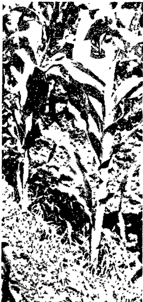
A directed post-emergence treatment in corn with "Lorox" provides contact kill of growing weeds and grasses, as well as control of germinating weed seedlings.

Soybean and Corn Growers: Control those weeds and grasses this season with new DuPont "Lorox". It offers you these unique advantages: