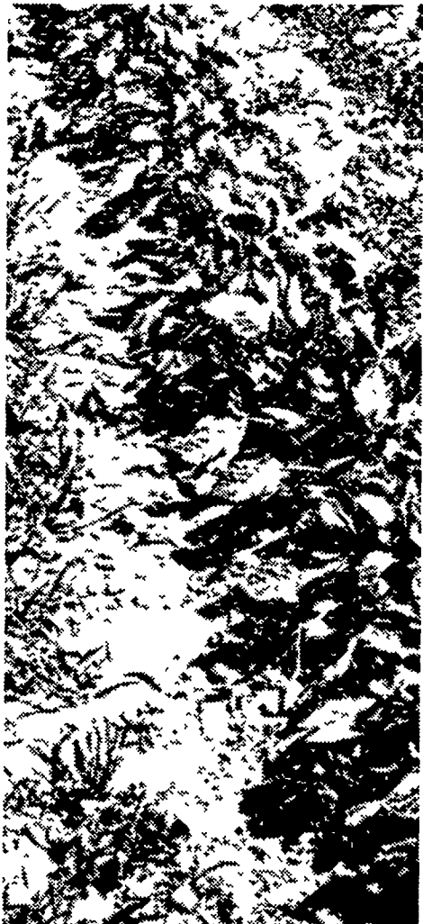
In soybeans, pre-emergence weed control with "Lorox" keeps rows free of annual weeds and grasses that steal water, nutrients and sunlight... and profits.