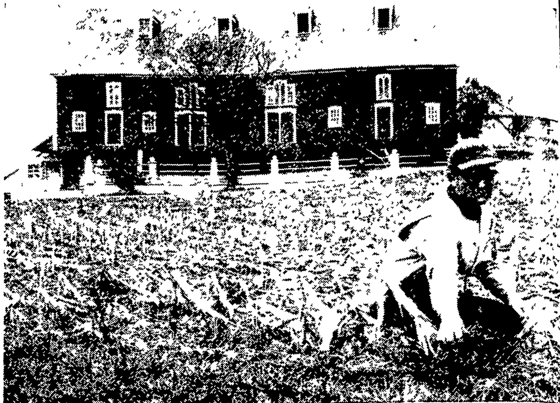
RYEGRASS IN THE CORN FIELD helps to protect the soil during the winter and provides more organic matter to be plowed down in the spring. Corn will go back in this strip this year, but with good conservation farming practices soil fertility is increasing.