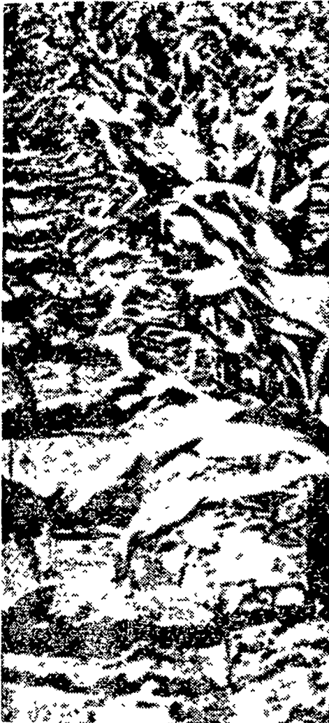
Applied pre-emergence in corn at planting time, "Lorox" gives effective residual control of germinating annual weeds and grasses including tough giant foxtail.