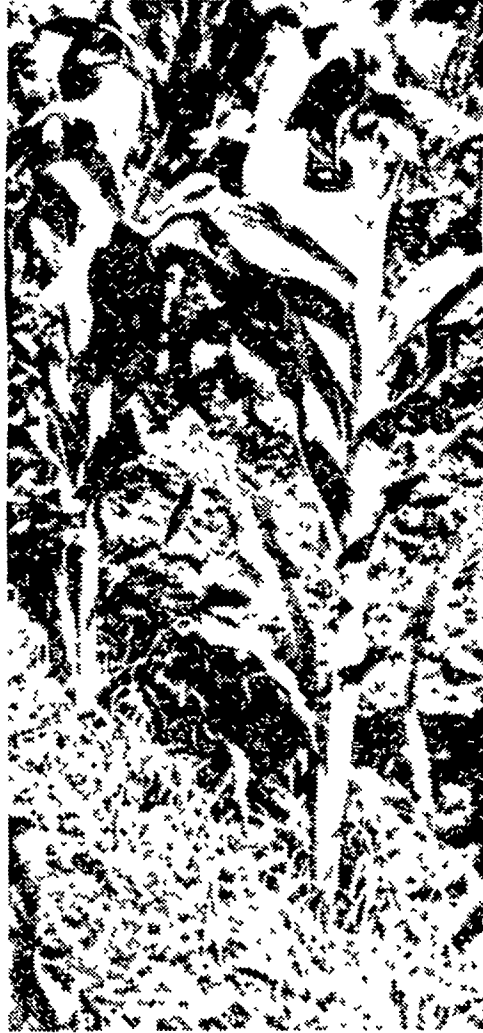
A directed post-emergence treatment in corn with "Lorox" provides contact kill of growing weeds and grasses, as well as control of germinating weed seedlings.

Soybean and Corn Growers: Control those weeds and grasses this season with new DuPont "Lorox". It offers you these unique advantages: