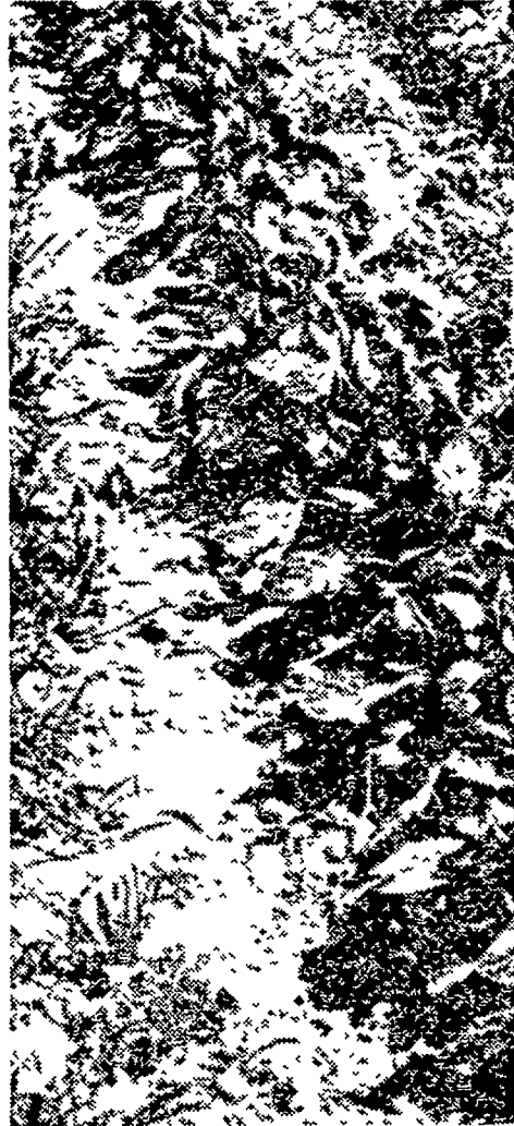
In soybeans, pre-emergence weed control with "Lorox" keeps rows free of annual weeds and grasses that steal water, nutrients and sunlight...and profits.