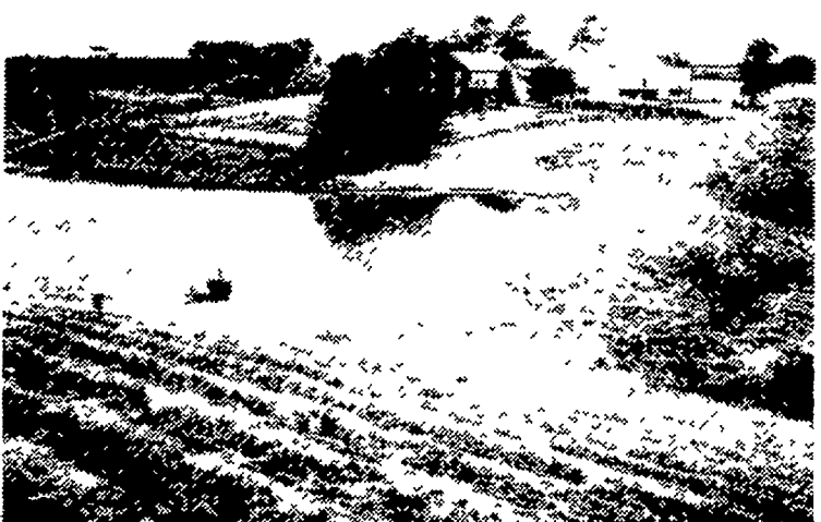
FARM PONDS like this one near Lititz provide beauty as well as service. Fire protection, water supply for livestock and irrigation, are provided by this pond. It also provides recreation such as swimming, boating and fishing. The fish commission provides assistance in deciding what fish are best for stocking in particular ponds.