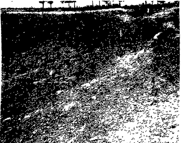
A NATURAL DAM in this gutter was formed by the sod. Water flowing down the waterway takes soil with it if the soil is not held in place by some kind of cover. Grass waterways are one of the major tools of the conservationist.