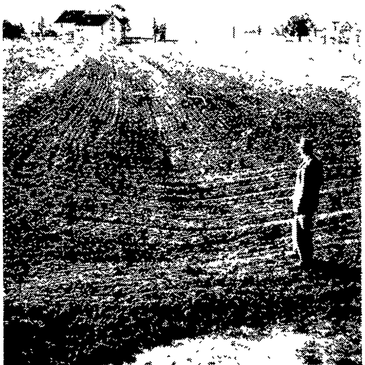
WATER FLOWS SLOWLY in a terrace which is nearly on the level. Slow-moving water has much less soil carrying capacity than rushing water has. Many soil saving practices such as this can be partially financed by the U.S. Agricultural Stabilization and Conservation Service. Martin Muth, Work Unit Conservationist inspects the finished job.

Cover & Green Manure Crops — 1063 acres. Crop Residue Use — 2254 acres Cutback borders — 7635 feet. Diversions — 10,513 feet. Ponds — 1. Fish Pond Stocking — 5. Grassed Waterways — 77 acres Land Clearing — 25 acres. Obstruction Removal — 12.6 acres. Pasture and Hayland Renovation — 25 acres. Pasture and Hayland Planting — 275 acres. Rotation Grazing — 15 acres Contour Strip Cropping — 3116 acres. Field Strip Cropping — 27 acres Drainage Field Ditches — 2350 feet Tile Drains — 10653 feet. Tile System Structures — 16. Tree Planting — 12 acres. Wildlife Habitat Development — 3 acres. Woodland Harvest Cutting — 10 acres. Plow Planting — 14 acres. Grasses and Legumes in Rotation — 93 acres Woodland Pruning — 100 acres Structures For Water Control — 1 Land owners and operators applying one or more income-producing recreation enterprises — 1