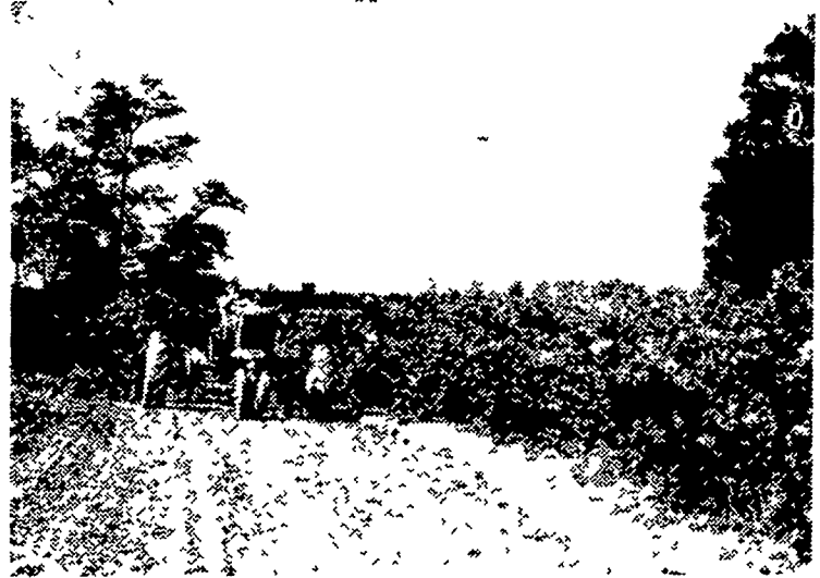
WOODLAND BORDERS between fields and woods provides shelter and food for many kinds of wildlife. The Game Commission cooperates with the Soil Conservationists in providing materials for planting and in laying out the plantings.

Bedding — 12 acres. Conservation cropping systems — 3324 acres. Contour farming — 3122 acres.