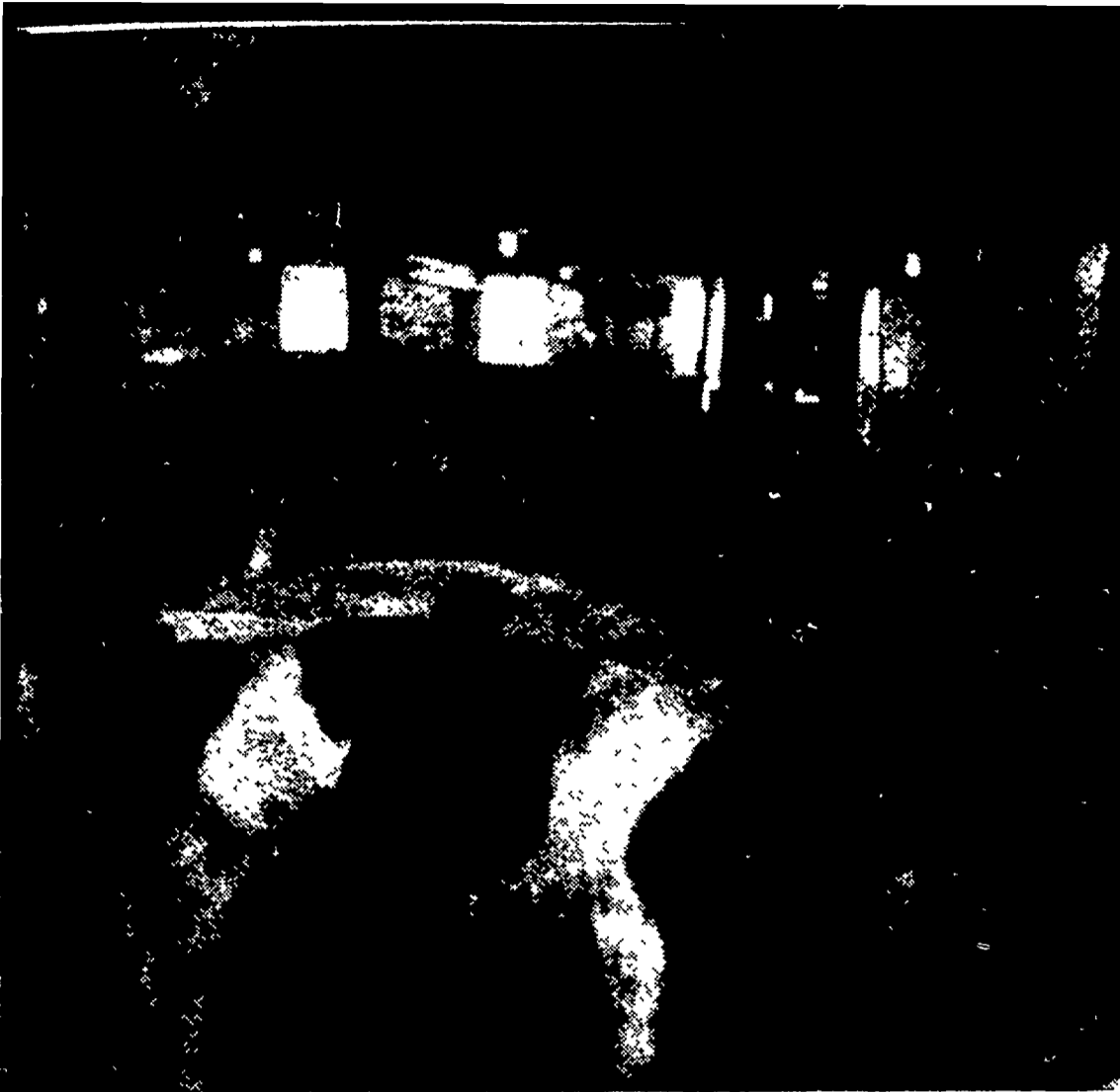
DAIRY HEIFERS IN A NEWLY REMODELED barn have more room and eating space than they had in the smaller pens. Feeding is easier and cleaning out can be done with a tractor now that the old permanent partitions have been replaced with movable ones on the Elvin Hershey farm, Lincoln Highway, west of Lancaster.