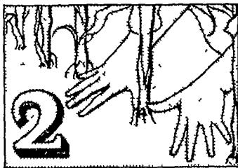
...plant it thicker...