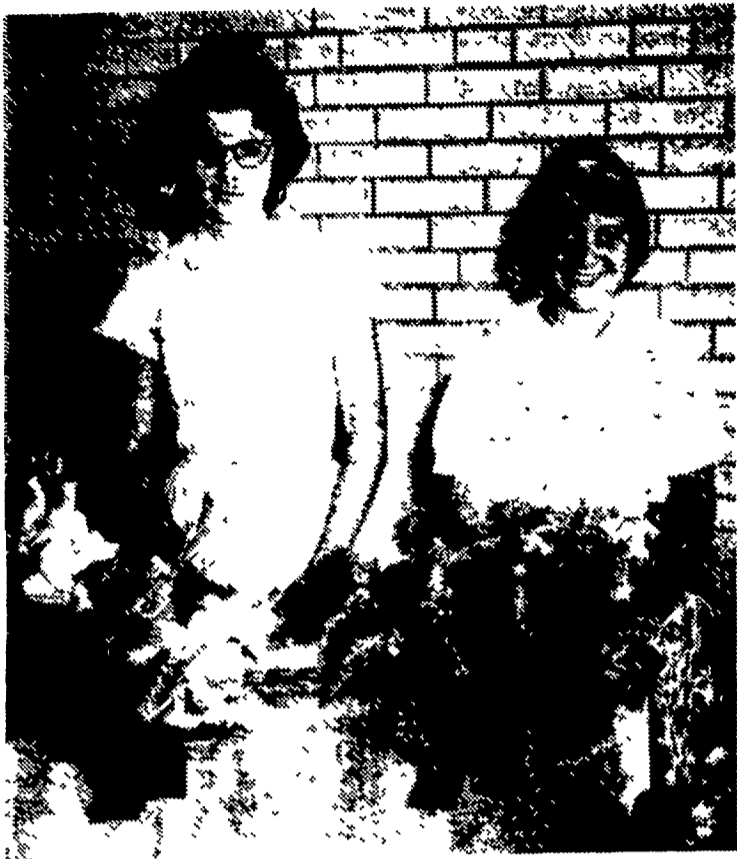
Pictured are Outdoor Flower division winners of the County-Wide 4-H Flower and Vegetable Roundup held at Penn Manor High School Tuesday.