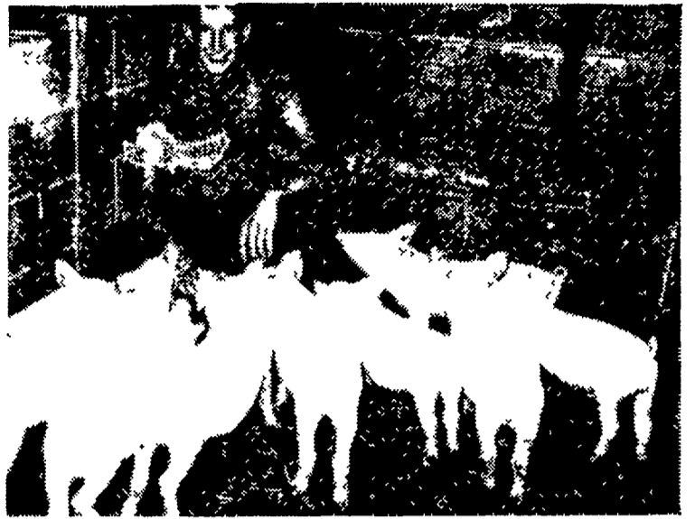
PIGS DON'T SEEM TO REALIZE they do not belong to Melvin Breneman any more. The litter has been sold, but the buyer has not yet picked them up. Melvin keeps five sows which averaged 10 pigs each at weaning time at the last farrowing. Melvin carries the swine program in conjunction with the dairy operation on the farm.