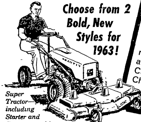
Super Tractor including Starter and Governor—with Steering Riding Attachment, 50" Rotary Mower

Choose from 2 Bold, New Styles for 1963!