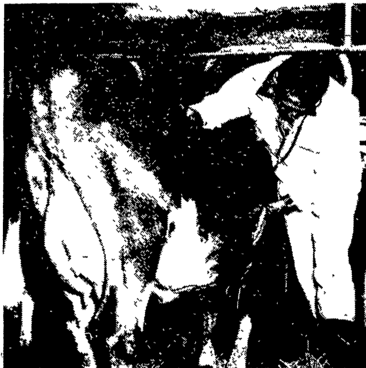
THE HEART AND LUNGS tell a veterinarian much about the general health of an animal. Just as a medical doctor listens to the chest cavity of his human patients, the veterinarian examines the chest of his animal patients with the stethoscope. The thermometer is also an ever-present instrument in the hands of the veterinarian — just as it is with the M.D.