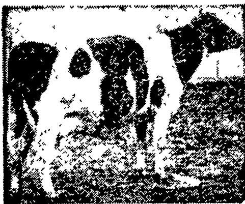
BEFORE CALVING This cow was fitted on the Pioneer program for 60 days before calving. Note the excellent "dry cow" body condition.