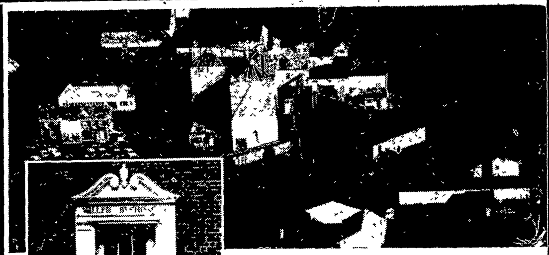
Aerial view of Miller and Bushong plant — one of the most modern, versatile, and efficient in the country — equipped for extreme accuracy in feed manufacturing.

identified, will return to the Dairymen's Association, at 47th exposition, Jan. 7-11, to Poultry Federation. They operate as part of the Food, and church stands will supply Center at the east end of the main food service main hall of the 14-acre Farm that includes a large cafe Show Building. They are the State Beekeepers Association, portable sandwich and milk Horticultural Association, Co-dispensing units to be located operative Potato Growers, throughout the building.