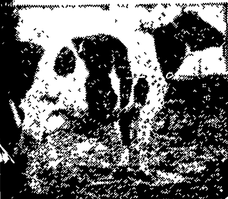
BEFORE CALVING This cow was fitted with the Pioneer program for 60 days before calving. Note the excellent "dry cow" body condition.