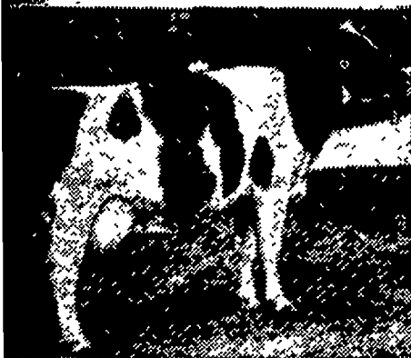
AFTER COMPLETING RECORD The cow after having produced 23,044 lbs. milk and 941 lbs. of fat as a 4 year old. Note the extreme dairyness and exceptional body condition shown after this cow produced 1 1/2 tons of milk!

600 pounds of PIONEER DRY and FRESHENING yields an extra TON OF MILK!