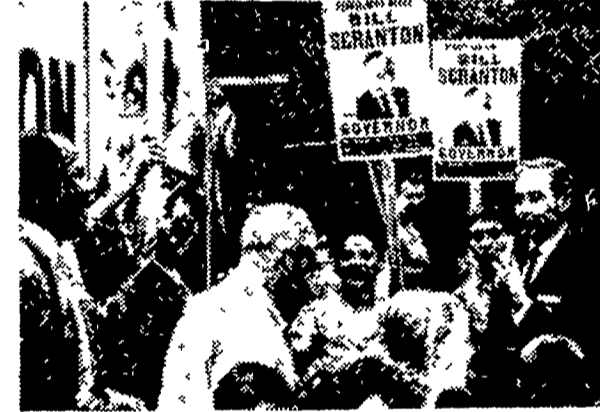
TOP-FLIGHT CONGRESSMAN —As a congressman, Bill Scranton fought for Pennsylvania cities and farmers, for industrial development, urban renewal, civil rights, a strong economy, a fair break for every American and every Pennsylvanian.