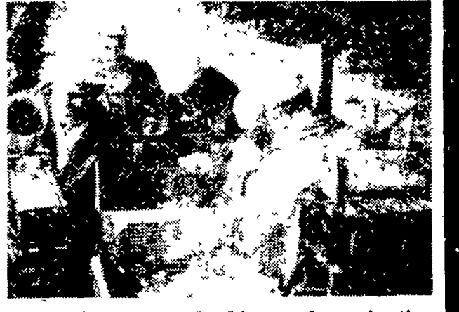
A service crew debeaking and vaccinating a Hornco fed flock at 10 Days of age.