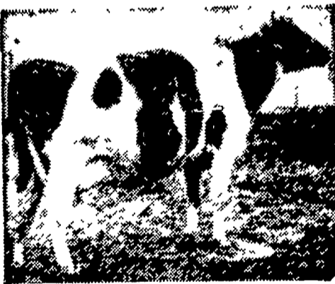
BEFORE CALVING This cow was fitted on the Pioneer program for 60 days before calving. Note the excellent "dry cow" body condition.