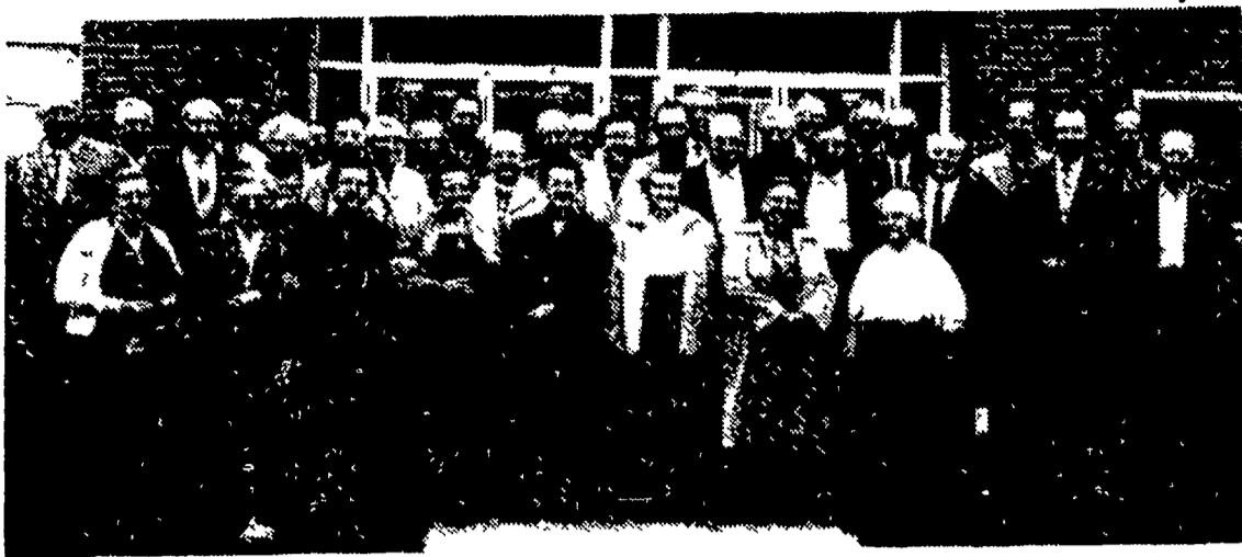
MEMBERS OF THE BERKS COUNTY Poultry Association who toured Lancaster County farms and business establishments Tuesday. Here is the group after their chicken barbecue dinner at the Lancaster Poultry Center.