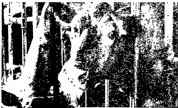
It's New from Wayne Research