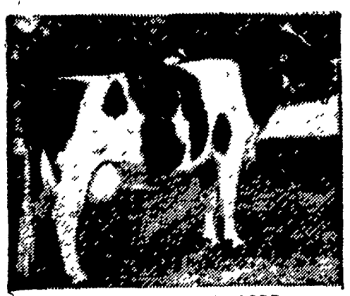
AFTER COMPLETING RECORD The sems cow after having produced 23,044 lbs. of milk and 941 lbs. of fat as a 4 year old. Note the extreme delryness and exceptional body condition shown after this cow produced 1311/2 tens of milkl

an the Fioneer progra ealving. Note the excellent "dry cow" body condition.